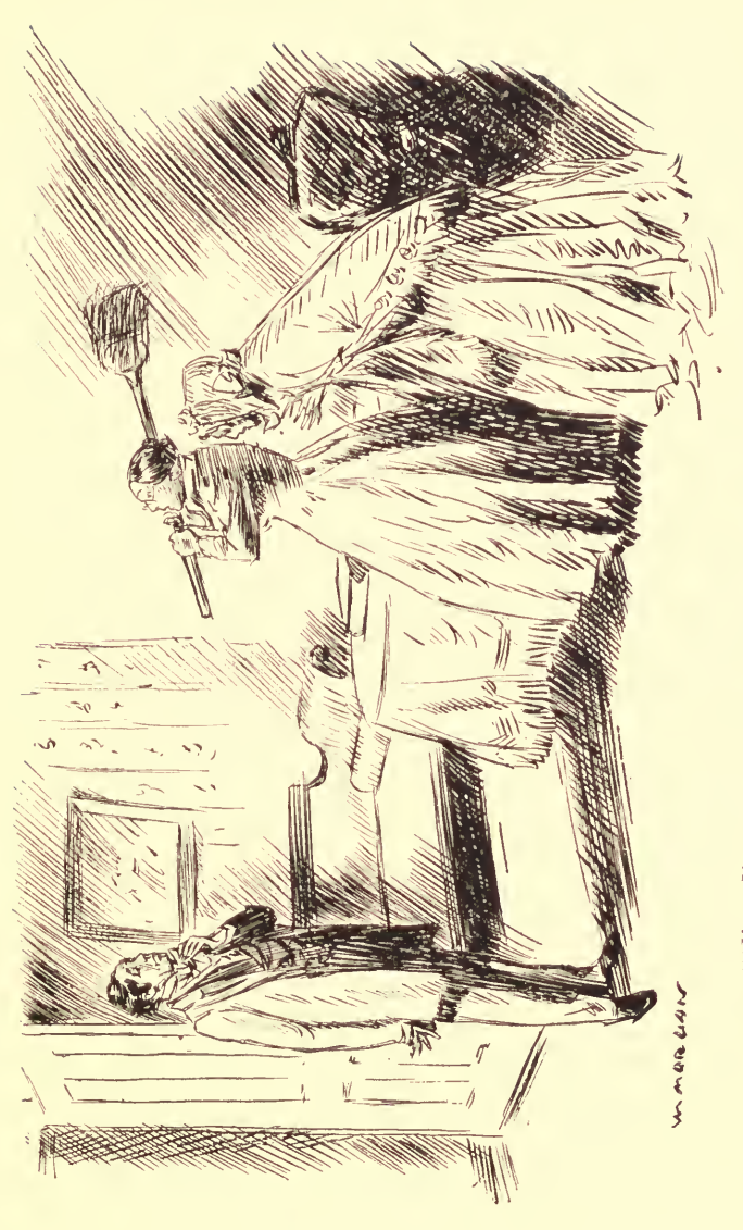
""I'm-I'm sure I beg your pardon, ladies,' he stammered."